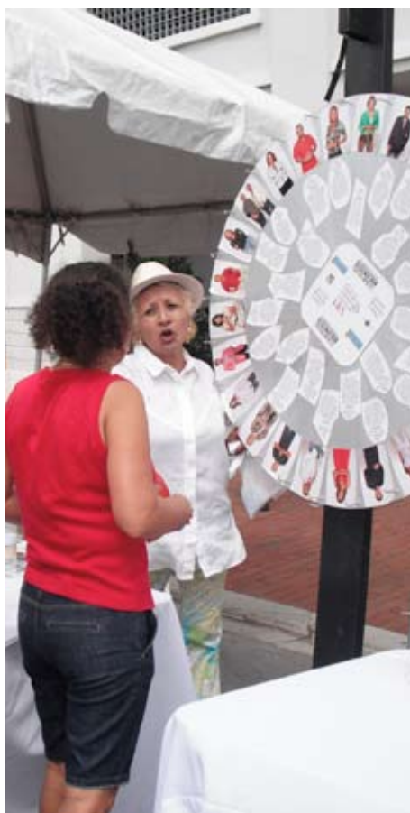
The Miami-Dade County Health Department hosts a roulette game at Calle Ocho using HIV prevention materials.