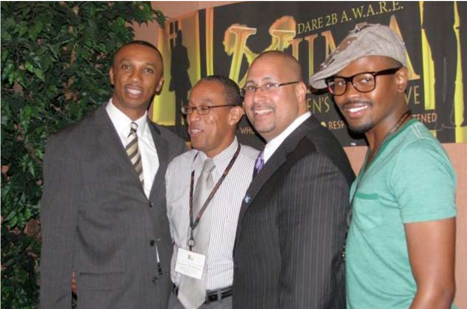
Ujima Men's Conference featured speakers.