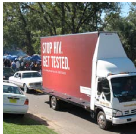
The mobile billboard moves across the state.

We Make The Change strives to build relationships with professional event hosts who share our goal of bringing HIV education to Florida's population – particularly to those who are at increased risk of infection. We consistently search for and evaluate potential event partnerships and sponsorship opportunities across the state. We select those that deliver an effective use of HIV prevention funds, local outreach and HIV testing services to event participants. ■